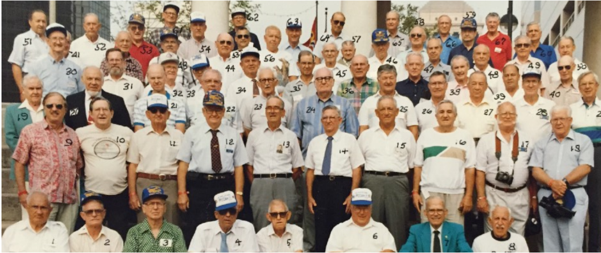
1991 - St Louis, MO, A very large turnout with 69 veterans in attendance plus wives, other family and friends.