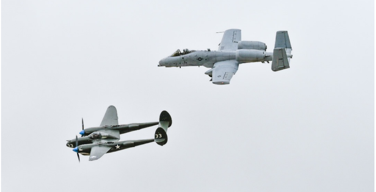
The P-38 Lockheed Lightning "White 33" and the A-10 Republic Thunderbolt "Warthog" flying together!