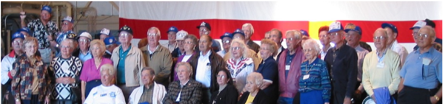
2001- Valdosta, GA, Everyone enjoyed being hosted by the 39th FTS.